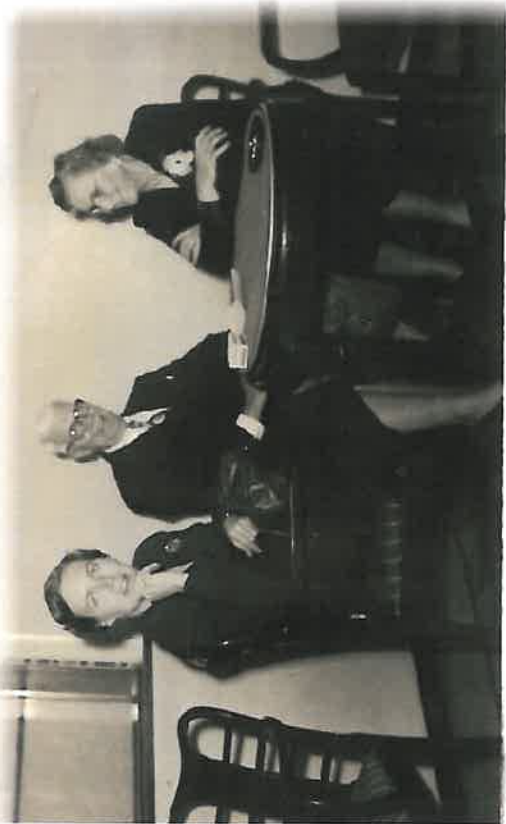
Photographed on Board